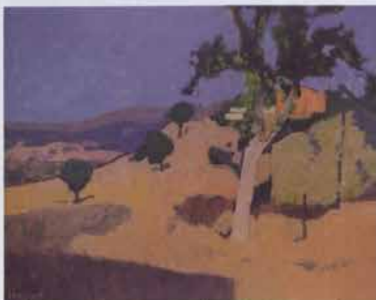
Colin Hayes, RA, PPRBA On the road to Kimi Evvia, Greece