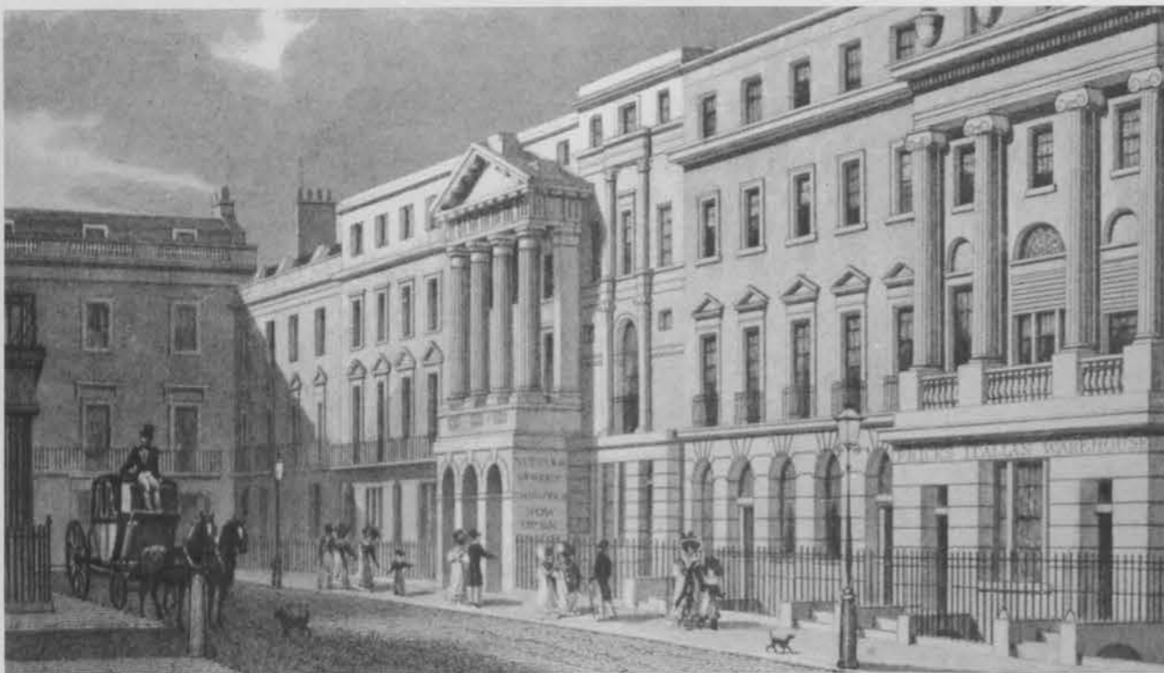
The former premises of the Society of British Artists at 6 1/2 Suffolk Street

Victoria by the Grace of God of the United Kingdom of Great Britain and Ireland, Queen, Defender of the Faith, to all to whom these presents shall come, greeting:-