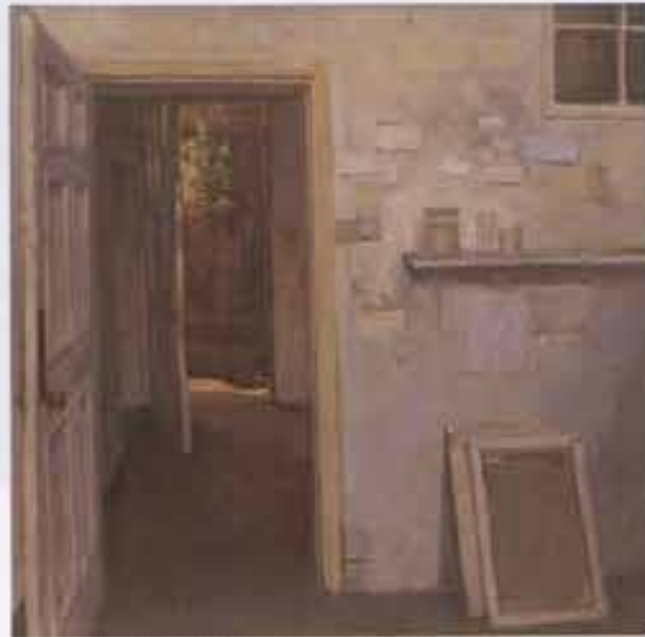
Charles Hartaker RBA, NEAC Interior with Open Doors