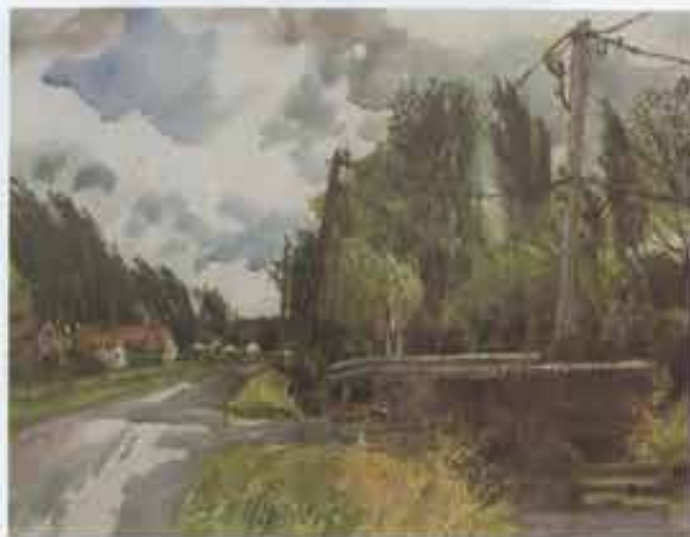
Jim Russell RBA Small Bridge near Galais