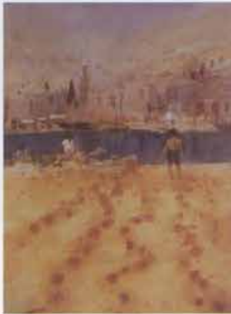
Grenville Cottingham RBA, RSMA - Drying Nets, Syria