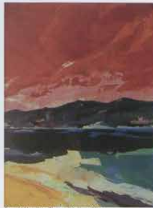
Donald Hamilton Fraser RA Hon. RBA - West Highland Landscape