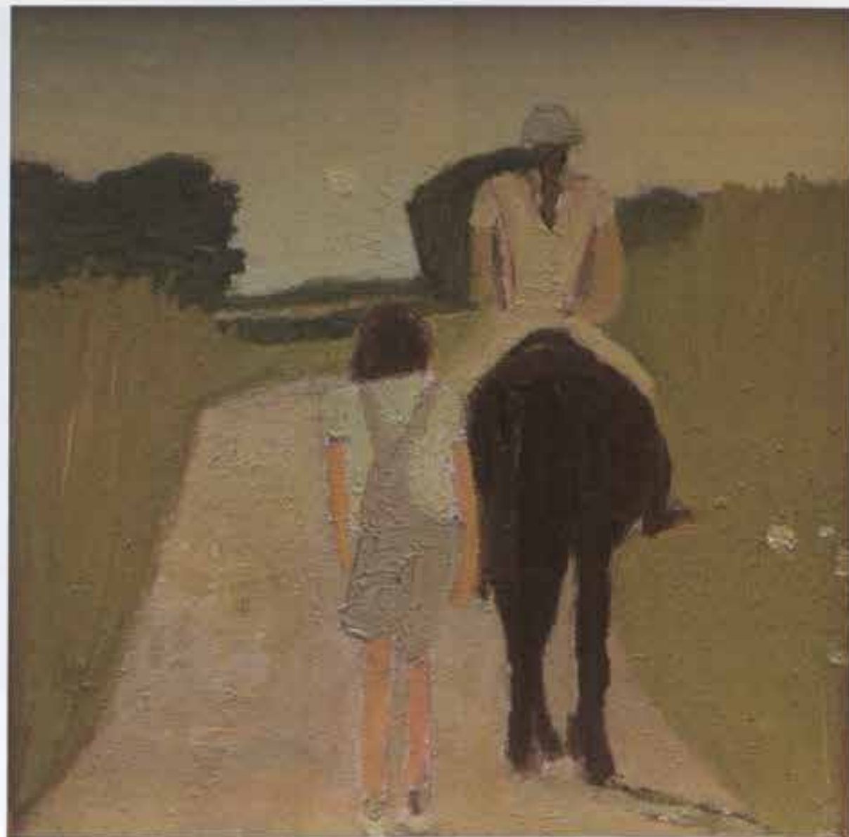
Alan Lambirth KBA - Pony Ride