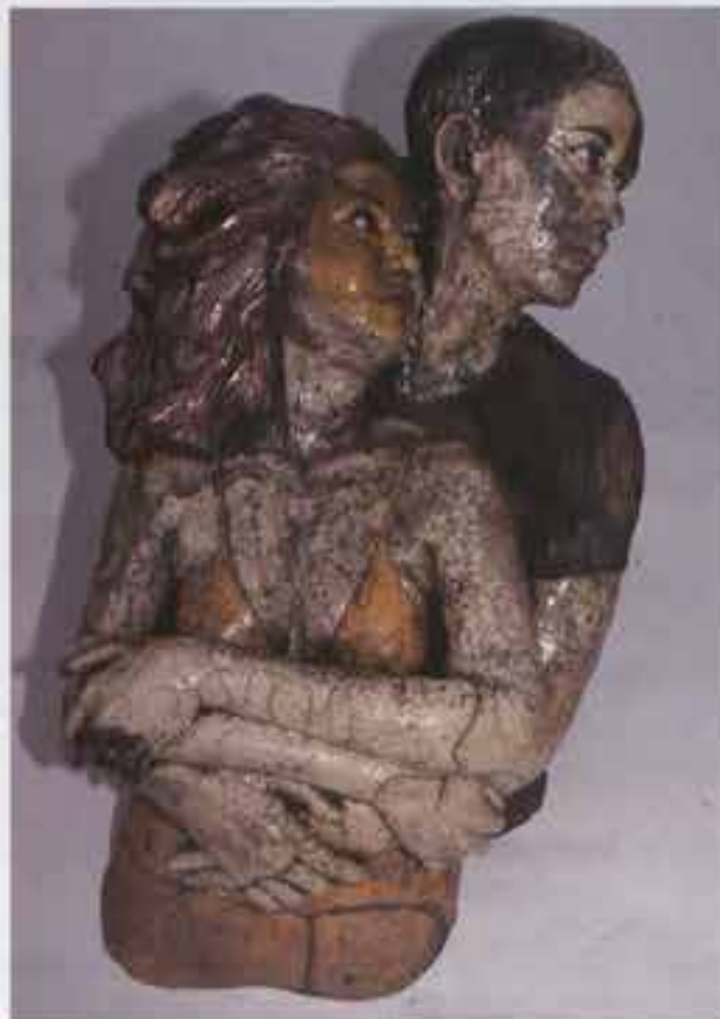
Dance from 'A Clockwork Orange'

Dora House, 168 Old Brompton Road, London SW7 3RA Telephone: 0171 373 5554 Fax: 0171 370 3721 ©2000 Sculpture Company dora.co.uk