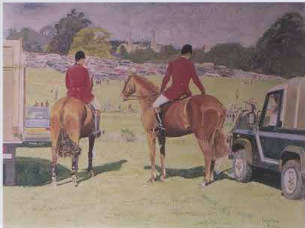
Waiting for the Horse Trials to begin

Winner St. Cuthbert's Mill Award RBA 1998. Crown Medal Society of Equestrian Artists 1997.