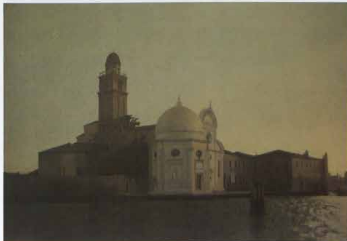
San Michele, Venice

If you would like more information about any of the courses we offer please contact Student Services (01296) 588399 or visit our website www.aylesbury.ac.uk