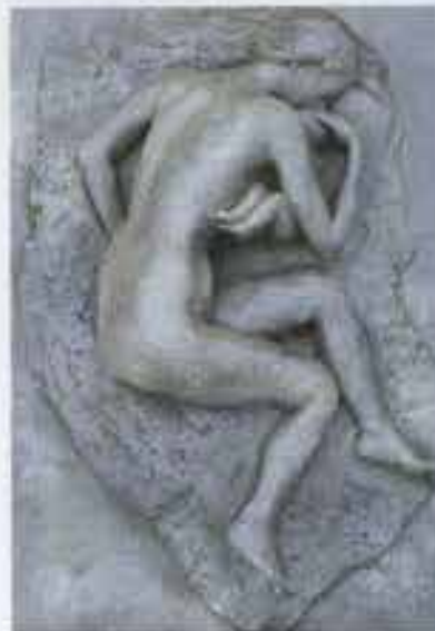
Quiet Time 1999