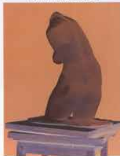
Round and Round 1995