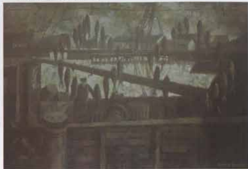
Cav Romeo Di Girolamo PRBA - Drying Flab